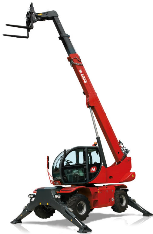
Load chart forklift with fork