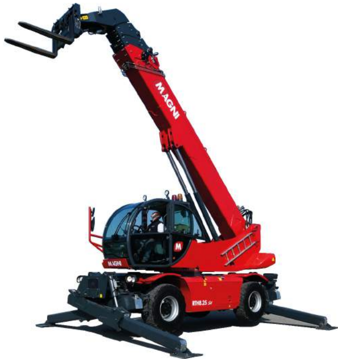
360° fully extended stabilizers load chart with forks